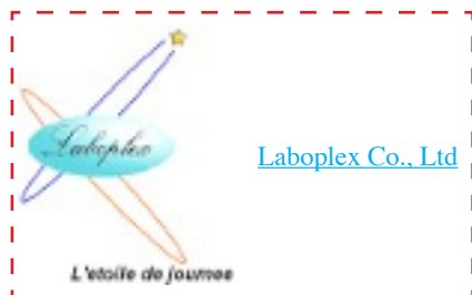
Laboplex Co., Ltd